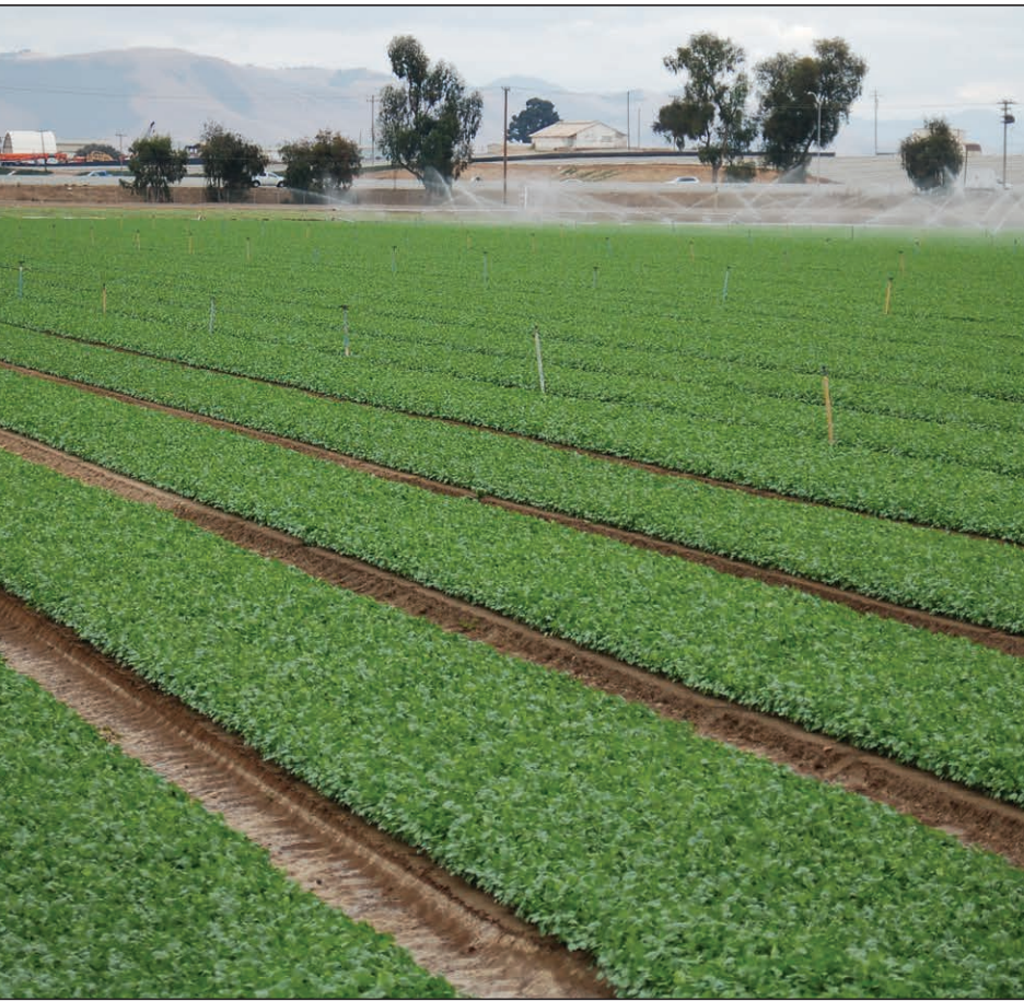
▲ Part of the Gold Coast Packing crop that makes it among the largest washed and ready to use cilantro packers in the world.

and shipping costs on a year-round basis. Other trucks picking up in the Valley will also be encouraged to take advantage of consolidation opportunities at the new location.